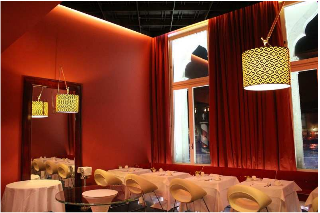
The Contemporary Breakfast Room With Red Velvet Curtains