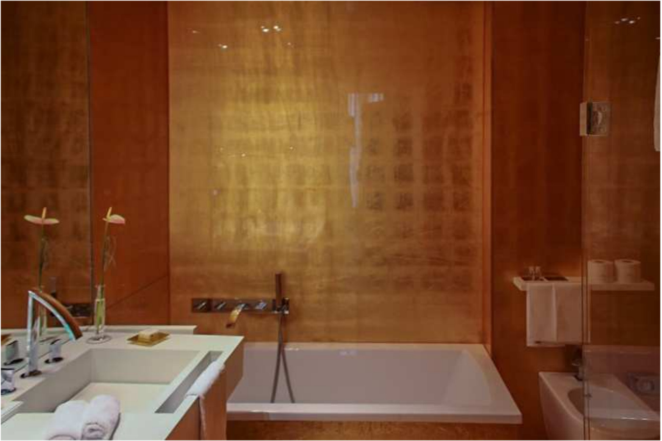
Gold Plated Bathrooms complete with large bath and shower.

If you look around the hotel, it is like you are in a boutique hotel in old world Venice. Morra stresses the mantra of the Sina brand of fine properties that is quite apparent as I meet with many of the hotel staff. “Our philosophy at Sina Centurion Palace and all Sina hotels is to put together Italian hospitality. We are family, a very noble family, and we are not afraid to hire the best people from all around the world, not only from Italy.”