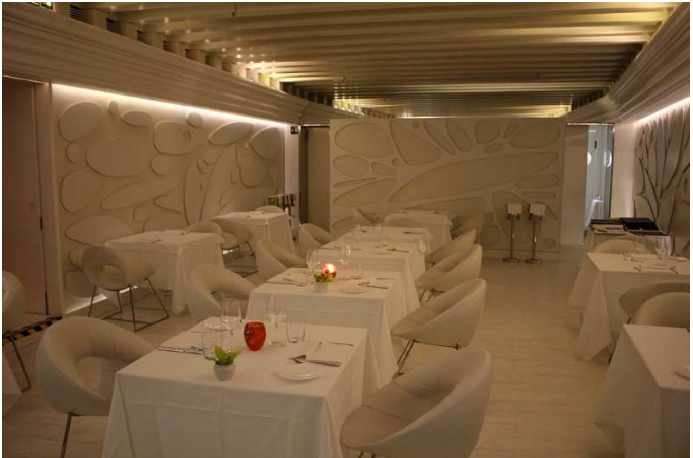
Antinoo Lounge and Restaurant – All Dressed in White.