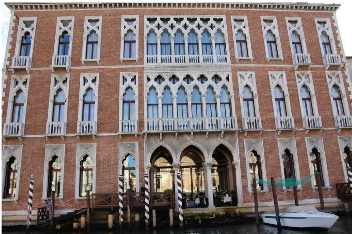
The 19th Century Façade – The Building is not old in comparison to Venice architecture.

Can a hotel inspire one to travel? In most cases, no. But the Sina Centurion Palace is that unique hotel experience that we all long for... a hotel stay that can change your entire perspective on a city or an area.