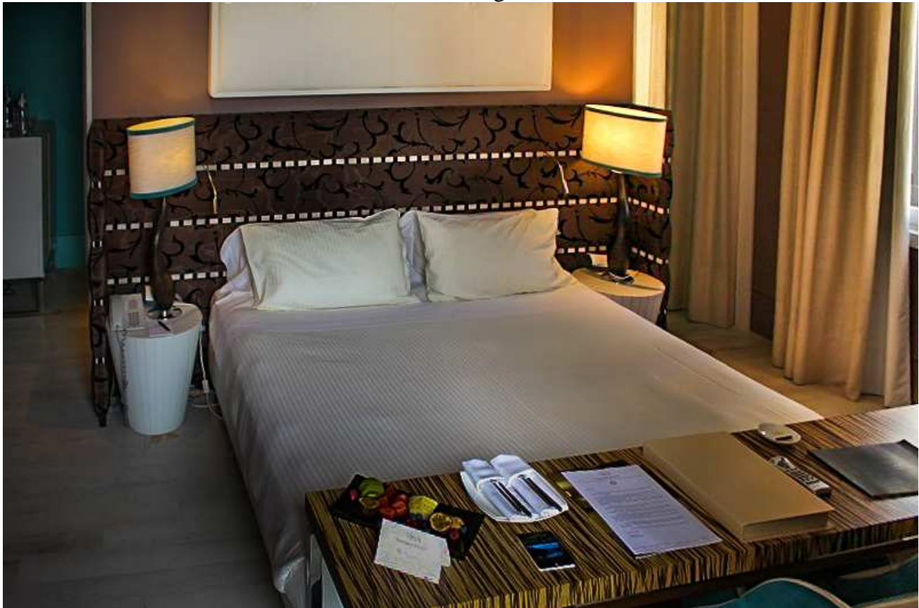
The Rooms are Modern in an inviting Contemporary Style.

“I know that we are not on the side of San Marco, but we have a superior location,” adds Morra. “We are a five star hotel, with all the categories of that stature: a presidential suite, junior suites, superior deluxe- all room categories that make us a five star hotel. We are a unique hotel in Venice with a nice mix of classic and modern design.”