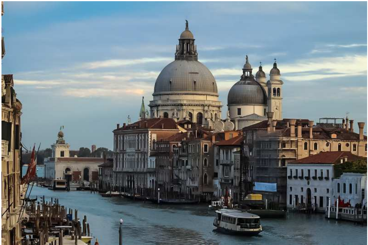
“Viva Venezia” – The Grand Canal with Dorsoduro and the Santa Maria Della Cathedral

Can a hotel inspire one to travel? In most cases, no. But the Sina Centurion Palace is that unique hotel experience that we all long for... a hotel stay that can change your entire perspective on a city or an area.