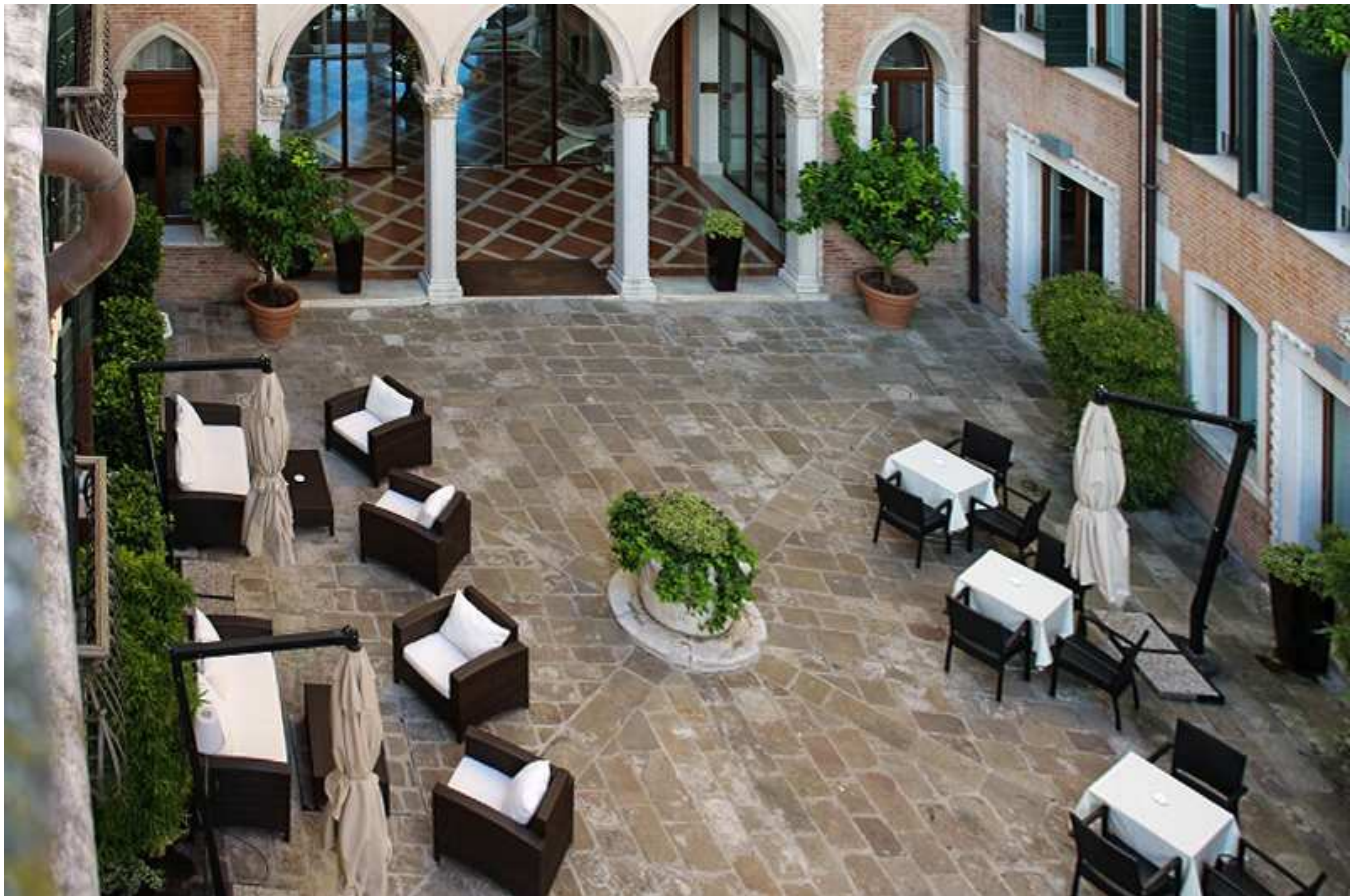
The Stunning Outdoor Courtyard.

I recently took a trip to Venice, that city of stunning architecture, long narrow canals, bridges, gondolas, the Carnevale, il Redentore festival, the historic regatta on the Grand Canal, fabled St. Mark's Square and more. The city that once was the epicenter of Europe also hosts one of the most contemporary hotel and luxury properties, the fabulous five star Sina Centurion Palace.